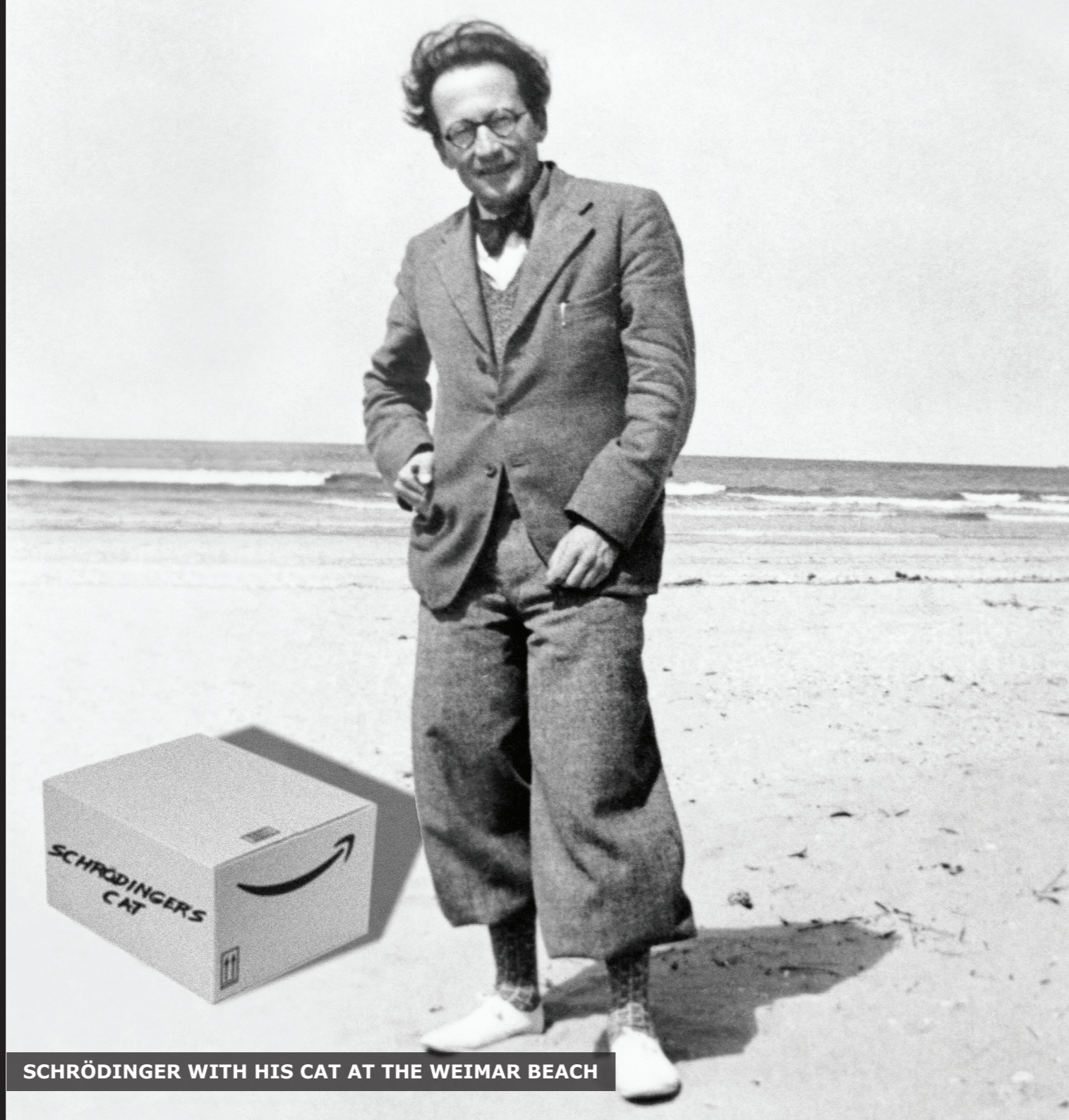
SCHRÖDINGER WITH HIS CAT AT THE WEIMAR BEACH

The townsfolk were baffled though because no discernable cat noises ever emanated from the box. This made people beg the question of whether or not there really was a cat in the box. This peaked the curiosity of the town so much, that in the local pub, the greatest of minds, such as Goethe, Schiller and Lizst, all theorized the answer.