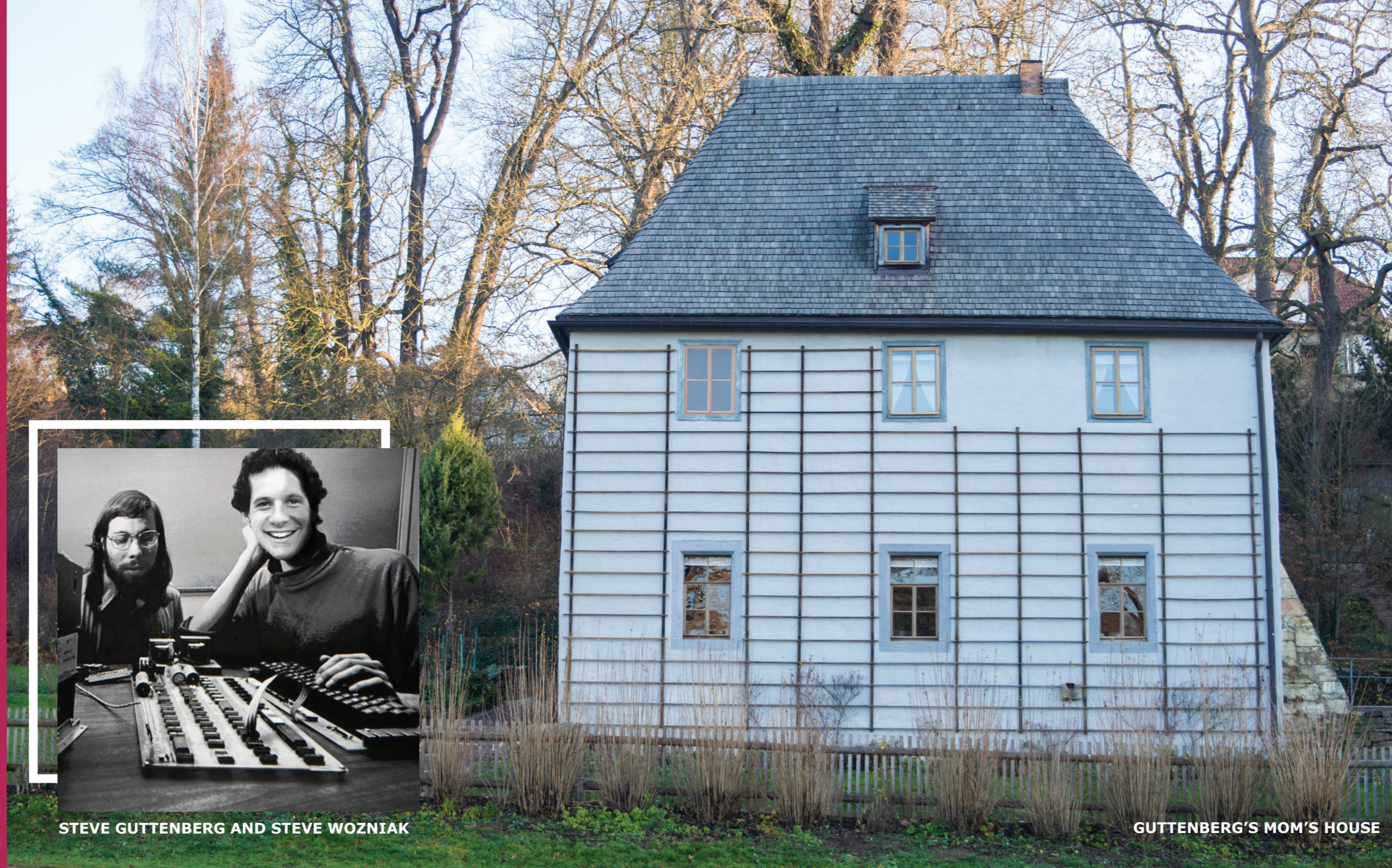
GUTTENBERG'S MOM'S HOUSE

earn their scribe degree, and as a lot of them could not afford to pay for 20 years of schooling, they had to take out copious amounts of student loans, which in turn translated to high scribe book making prices as they needed a return on their investment. Another problem with scribes was the fact that many altered their writings to a less colorful version, as they were paid by the book and not the hour, and their hands would become tired from writing countless years with feathered quills.