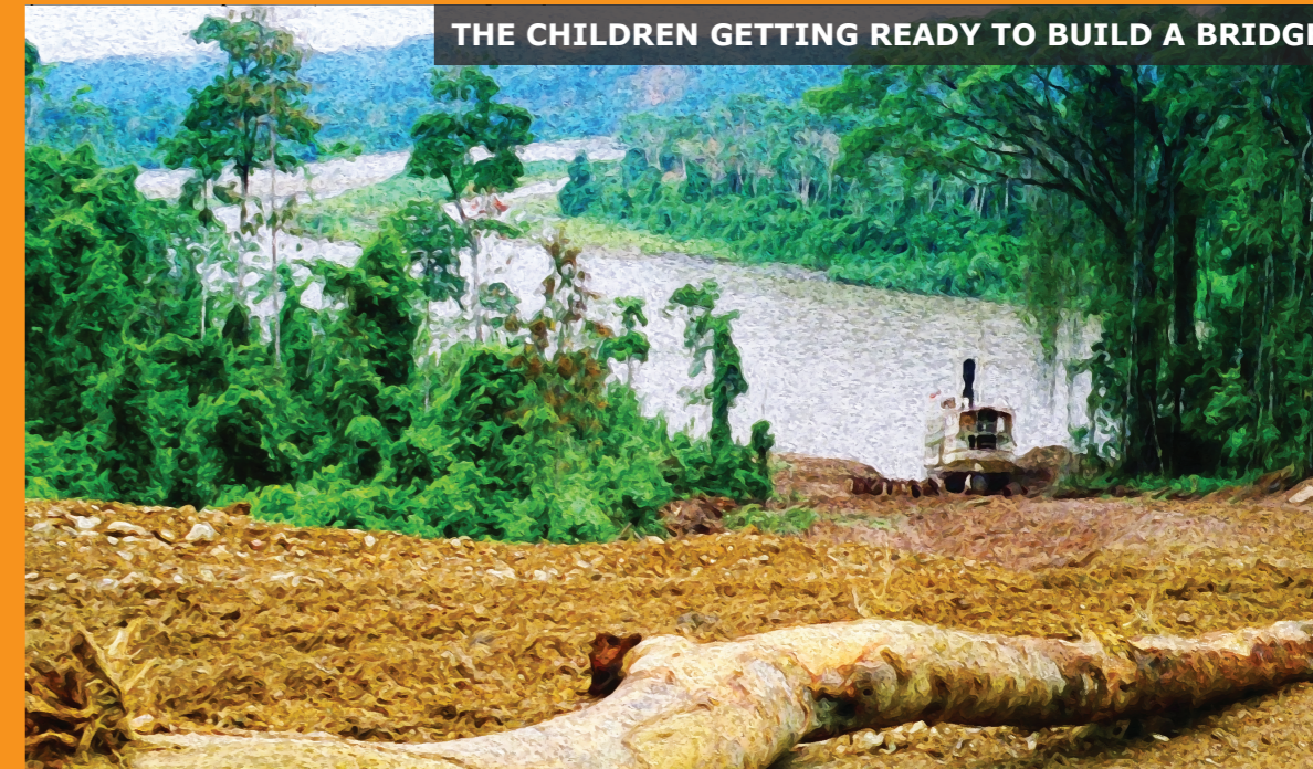
THE CHILDREN GETTING READY TO BUILD A BRIDGE

After two months of extraneous travel, they still hadn't made it to their destination, but they had, however, made it to Weimar, which at that point, was good enough for Christopher Columbus. He was mesmerized by this undiscovered land, populated by people, who were also undiscovered, which in turn he also discovered. He taught the local savages about siestas and the power of child labor. And they taught him quantum physics and the meaning of laughter. After much time conversing with the locals, his trip came to an end, and as he shook hands with the savages, he also gave them wrist-binding bracelets and a one-way ticket to Spain.