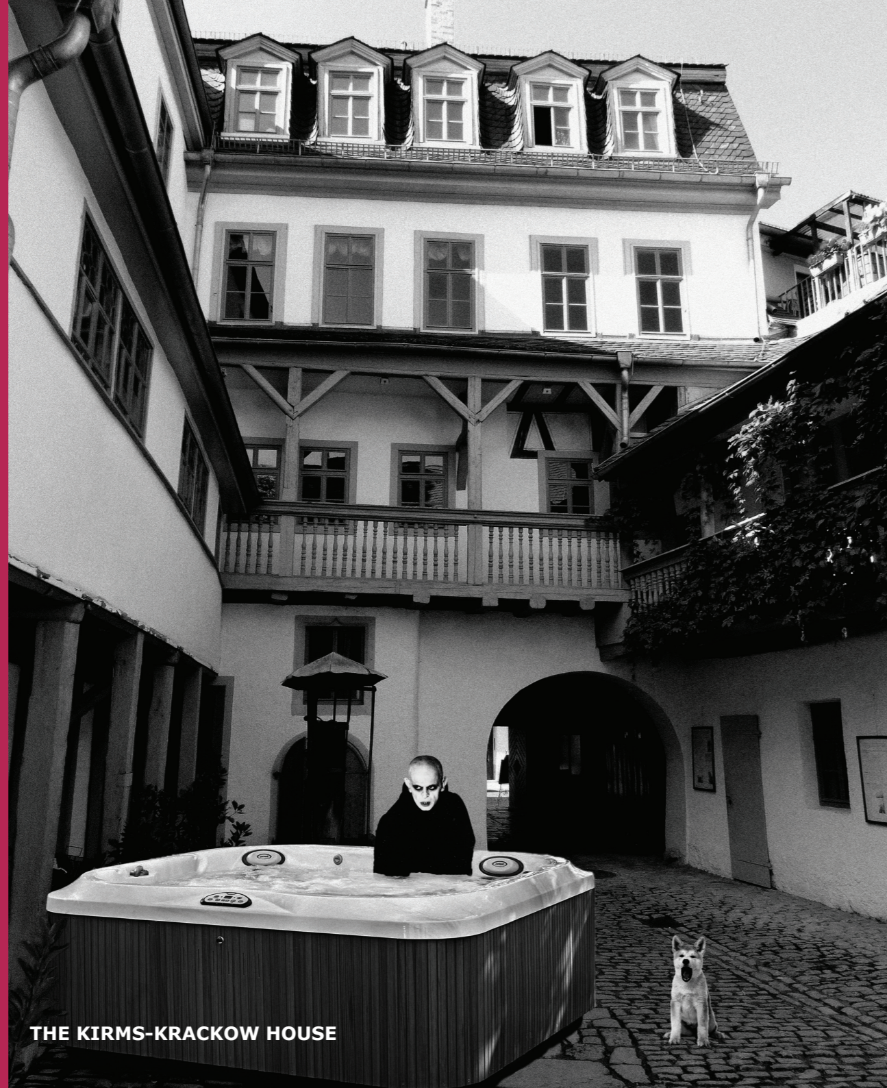
THE KIRMS-KRACKOW HOUSE

During this time, Weimar did not have its own police force; it had what was basically the equivalent to mall security, meaning they were useless jokes of a job with no real authority. Since there were no proper enforcements, Nosferatu could claim his victims quite easily. Apart from looking like a total weirdo, and acting like a total wierdo, Nosferatu did have ways to attract his prey. For one, he had a heated Jacuzzi with the jets, and everything. For two, he had cable television. For three, he had the