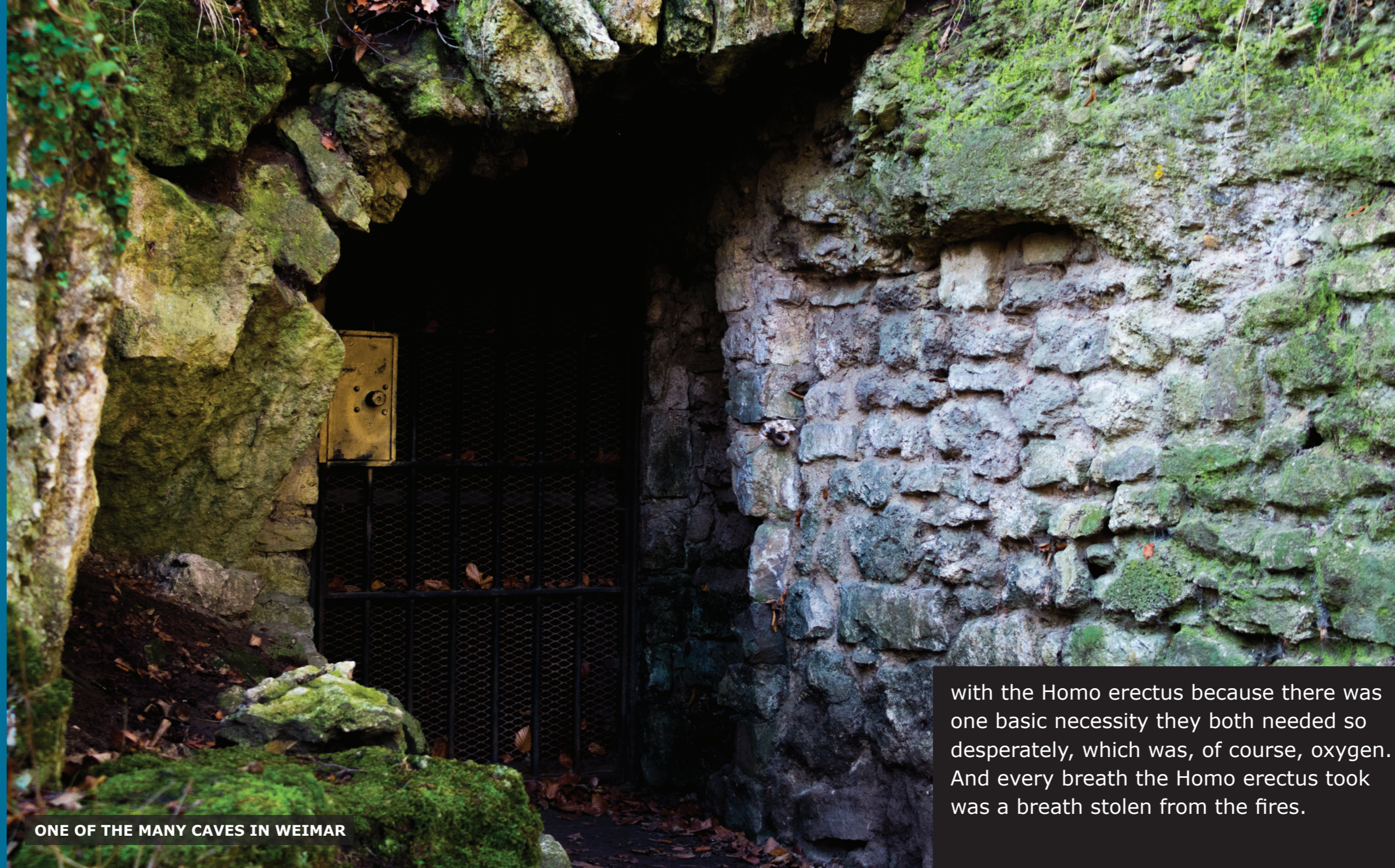
ONE OF THE MANY CAVES IN WEIMAR

The times were prosperous with the Homo erectus and their fires, until the fires became sentient and fought back. The fires realized that they were at competition