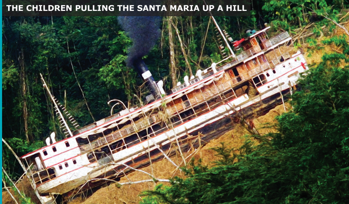
THE CHILDREN PULLING THE SANTA MARIA UP A HILL