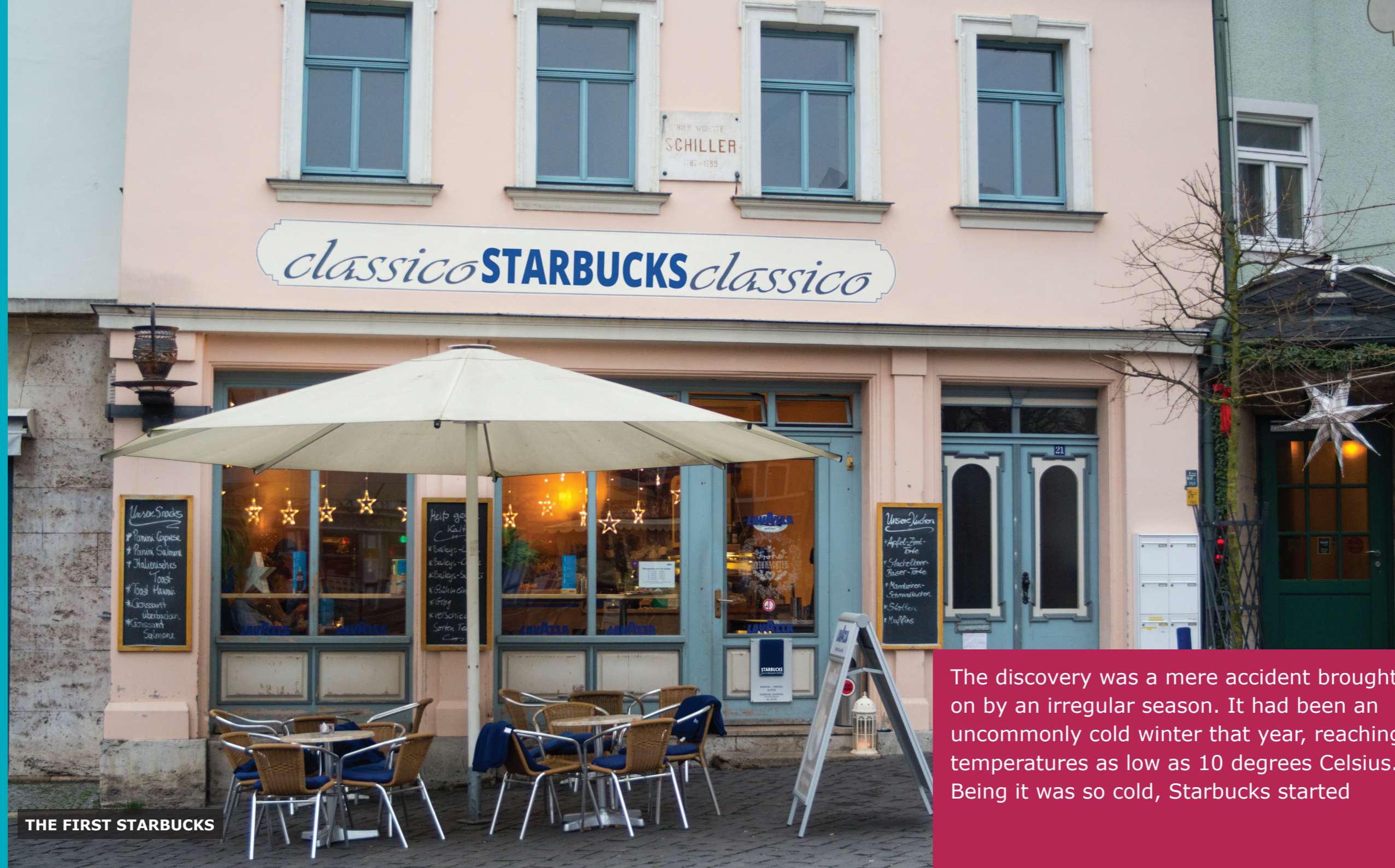
THE FIRST STARBUCKS

heating up its beans in large cauldrons so they would warm up customers' bellies, as well as their hands. One day the unthinkable happened, it started to lightly drizzle. Befuddled by the watery dribbles that befell upon them, the village folk dispersed as quickly as they could, finding shelter in every nook and cranny available. But during this 15-minute ordeal, magic happened, some of the cauldrons filled up with water and the heat from below caused what scientists labeled a brewing process.