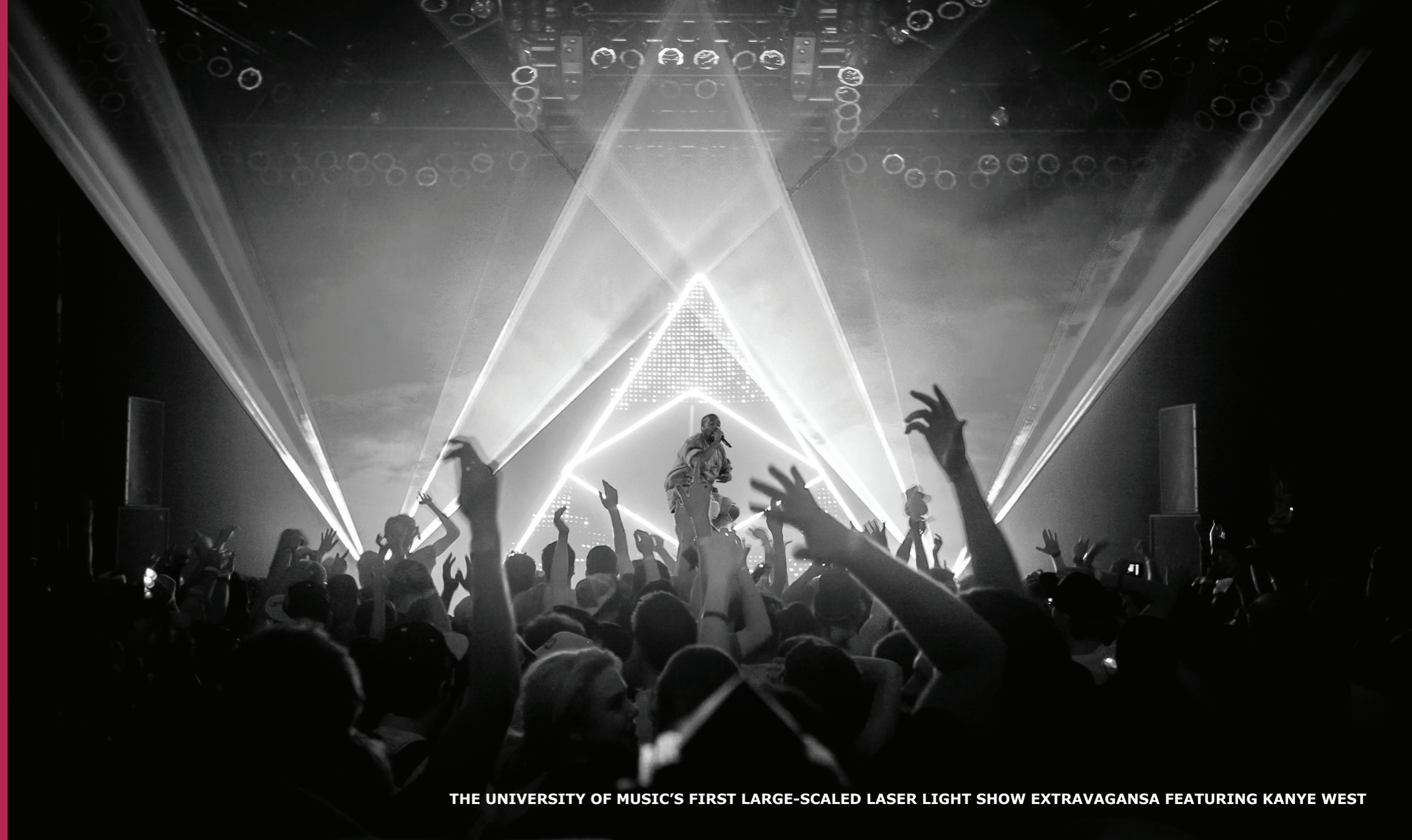
THE UNIVERSITY OF MUSIC'S FIRST LARGE-SCALED LASER LIGHT SHOW EXTRAVAGANSA FEATURING KANYE WEST

The week they opened, they threw a large-scale laser light show extravaganza with music headlined by none other than Kanye West himself. The show started off as a success because lasers and light shows are really cool, but unfortunately the awesomeness of the lasers and light show could not make up for the headliner. Kanye opened up great by playing his most popular song at the time, but before his second song, he asked everyone to get up, and the handicapped kid in the wheelchair in the back refused to do so; nobody knew why. Because of this little boy's actions, he ruined the first concert ever at the University of Music. Luckily, the school survived and is even still prospering today, even though music is dead.