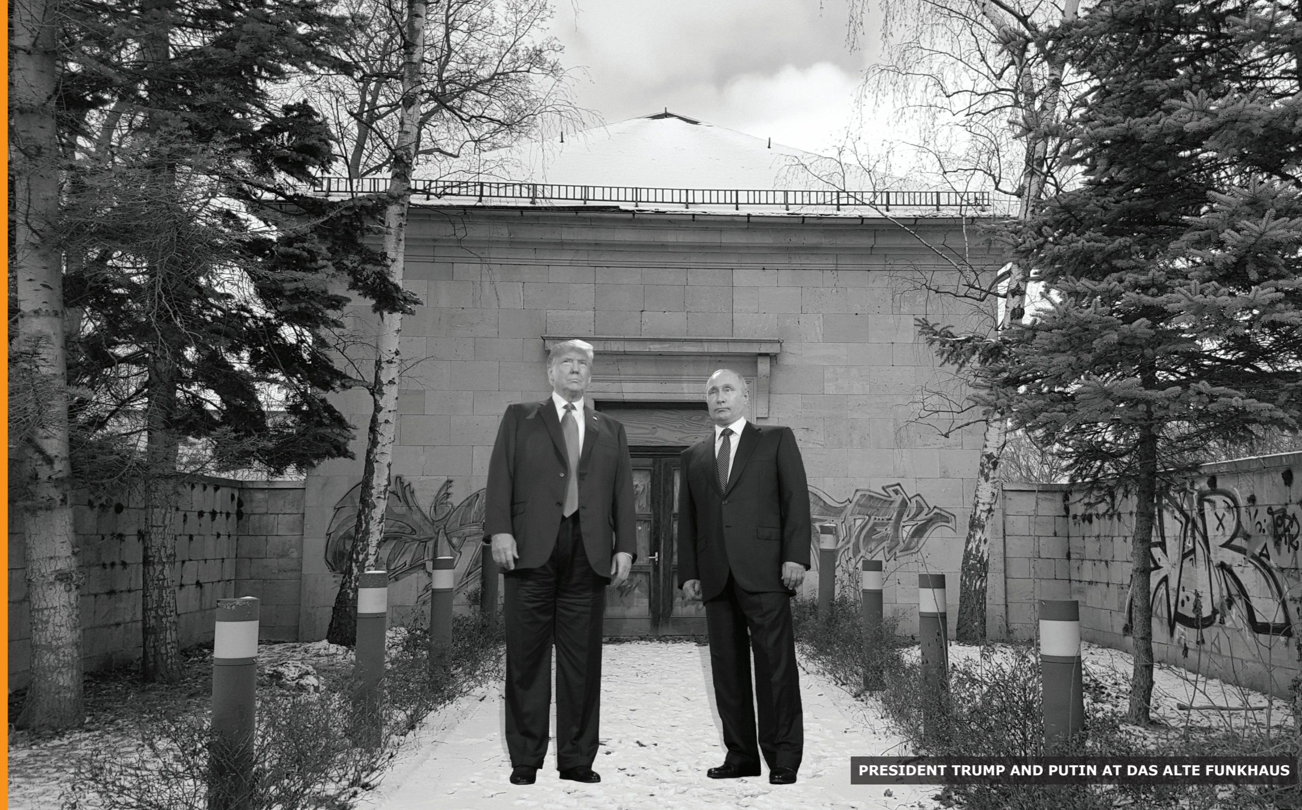
PRESIDENT TRUMP AND PUTIN AT DAS ALTE FUNKHAUS

In 1918, they broadcasted the first ever podcast at Das Alte Funkhaus (The Old Broadcast Studio) in Weimar to get the message across to the people to save the planet. The reason they did it at the Altes Funkhaus was at the time the Altes Funkhaus had the strongest radio tower known to man. With a wavelength range upwards of 50 kilometers, they could basically broadcast around the entire planet.