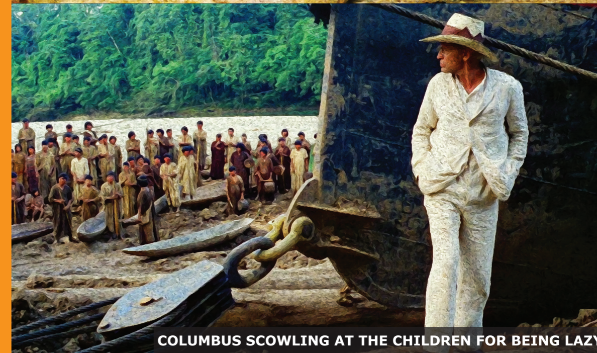
COLUMBUS SCOWLING AT THE CHILDREN FOR BEING LAZY