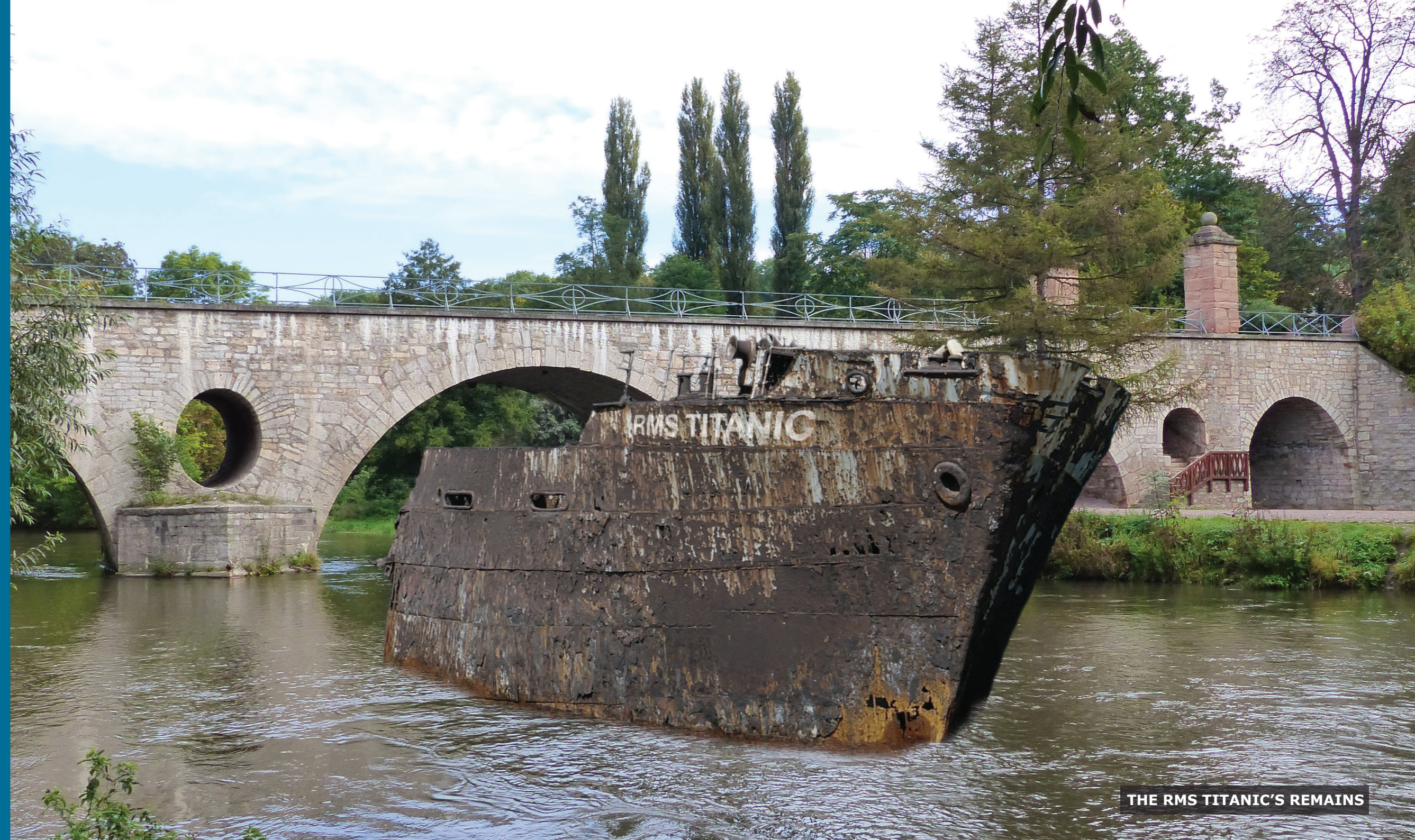
THE RMS TITANIC'S REMAINS

After endless seconds of this the Captain had had enough, and said, "Full steam ahead!" and pulled the little lever thingy. Little did he know that that would be their demise, because no matter how fast you go, if you hit something, it's going to be a bummer and your boat will sink. And sink it did. Legend has it, that during particularly hot summers from the Sternbrücke (Star Bridge) in Weimar you can see still see the ship that sunk a thousand years ago, minus nine-hundred, so like one-hundred years ago.