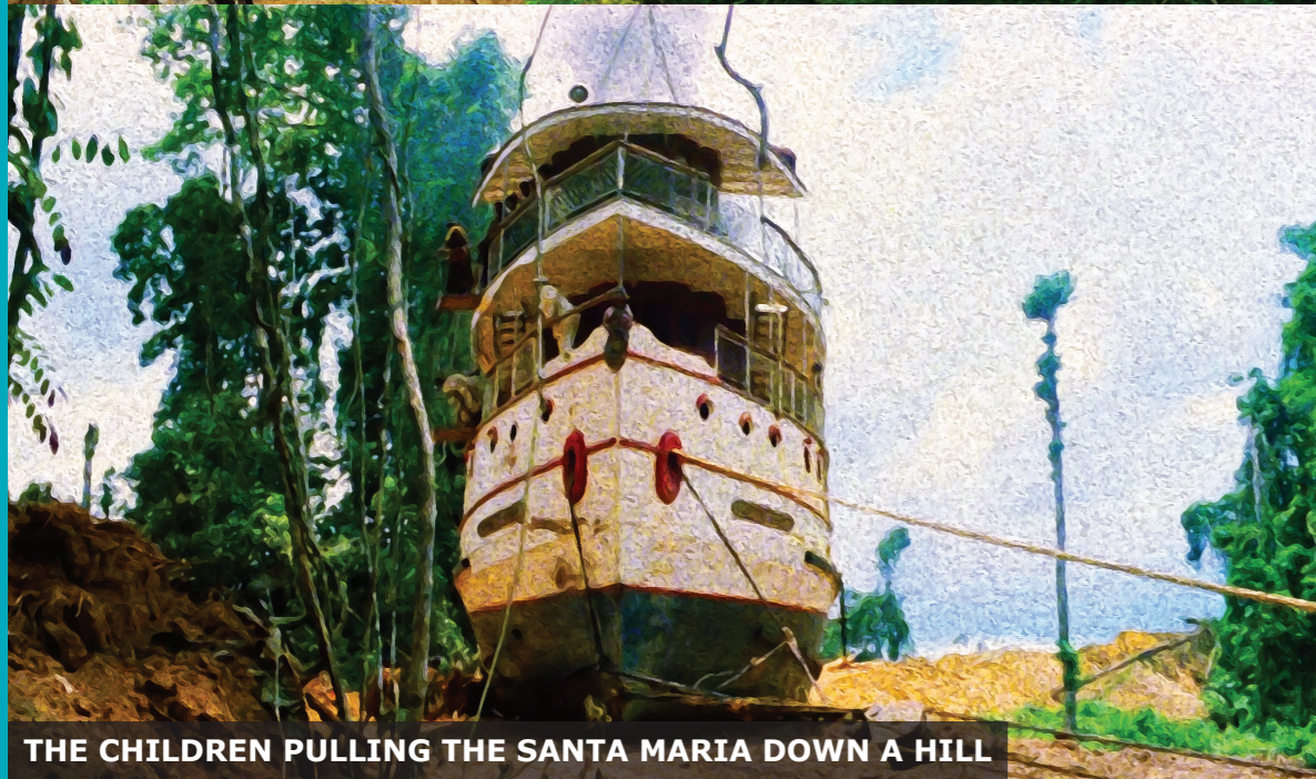
THE CHILDREN PULLING THE SANTA MARIA DOWN A HILL

He sailed on land with 3 ships: the Santa Maria, the Niña, and the Pinta. The crew on the vessels were around 90 people and the vessels were pulled by a crew of almost 1000 children. Since it was in the 1400's there were no child labor laws, so they received no toys for their hard work. On strenuous days when they had to traverse over enormous mountains, Columbus did, however, treat the most promising of the pack, with a sugar cube, which they would eat from his hand, as in tradition.